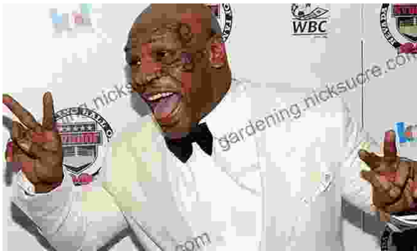
Image: Mike Tyson at a press conference, addressing his struggles and seeking redemption

However, Tyson's indomitable spirit eventually led him on a path to redemption. He found solace in therapy, meditation, and spirituality, and began to address the underlying issues that had plagued him for years. He also developed a keen interest in social and political issues, using his platform to speak out against injustice and promote personal growth.