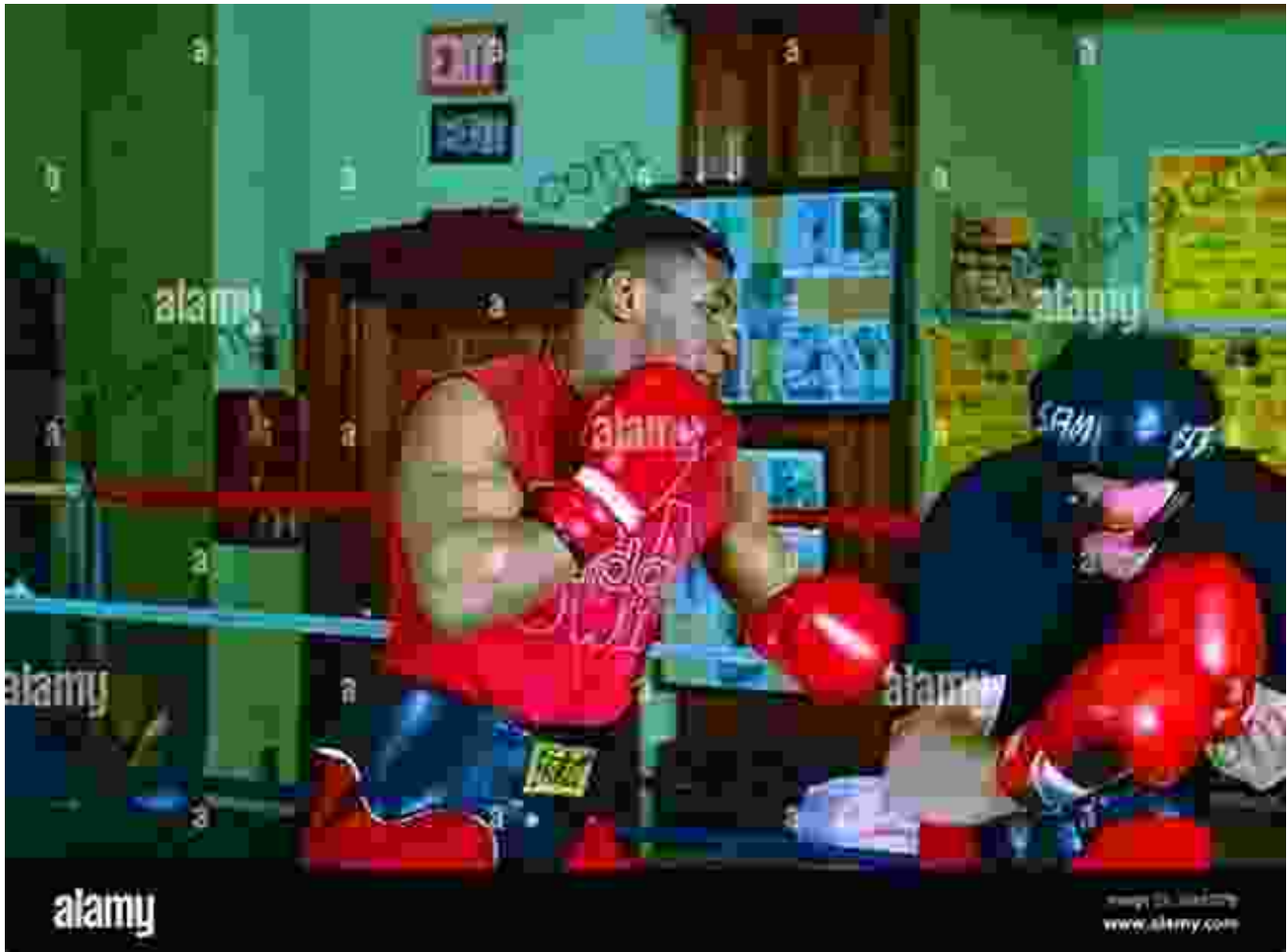
Image: Mike Tyson as a young boxer, sparring with Cus D'Amato

Under D'Amato's guidance, Tyson developed into a formidable boxer, quickly rising through the amateur ranks and earning a reputation as a devastating puncher. He turned professional at the age of 18 and went on to become the youngest heavyweight champion in history, knocking out Trevor Berbick in the second round at just 20 years old.