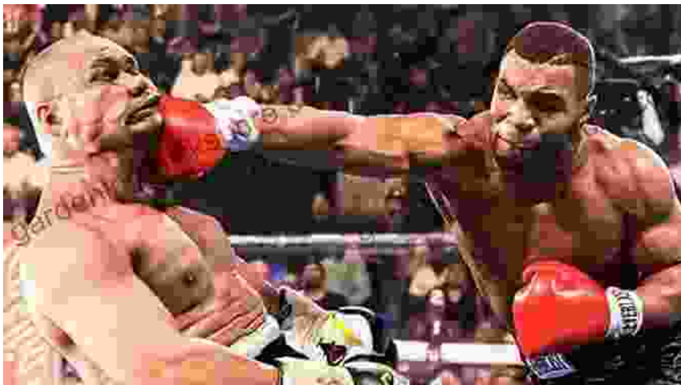
Image: Mike Tyson in the ring, delivering a knockout punch

Tyson's volatile temper and aggressive behavior outside the ring led to legal issues and damaged his public image. He was convicted of rape in 1992 and served three years in prison, tarnishing his legacy and casting a shadow over his career.