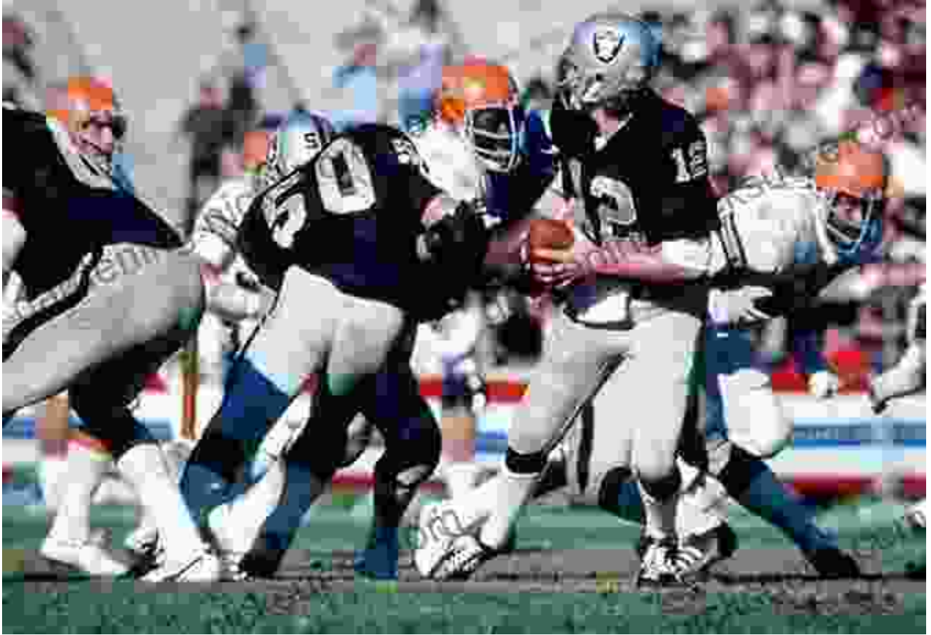
Ken Stabler, the "Snake," was the Raiders' dynamic quarterback.