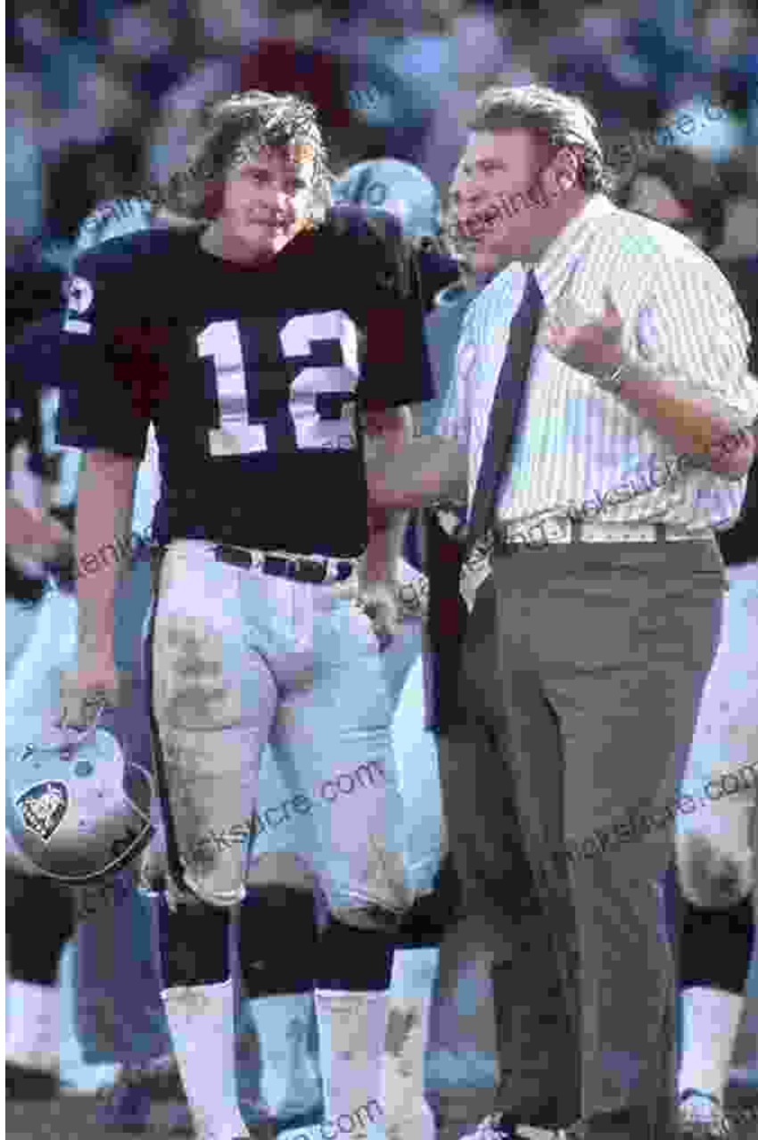
The legendary 1970s Oakland Raiders team.

In the words of legendary Raiders coach John Madden, "The Oakland Raiders are more than just a football team. They are a symbol of toughness, perseverance, and the never-say-die spirit."