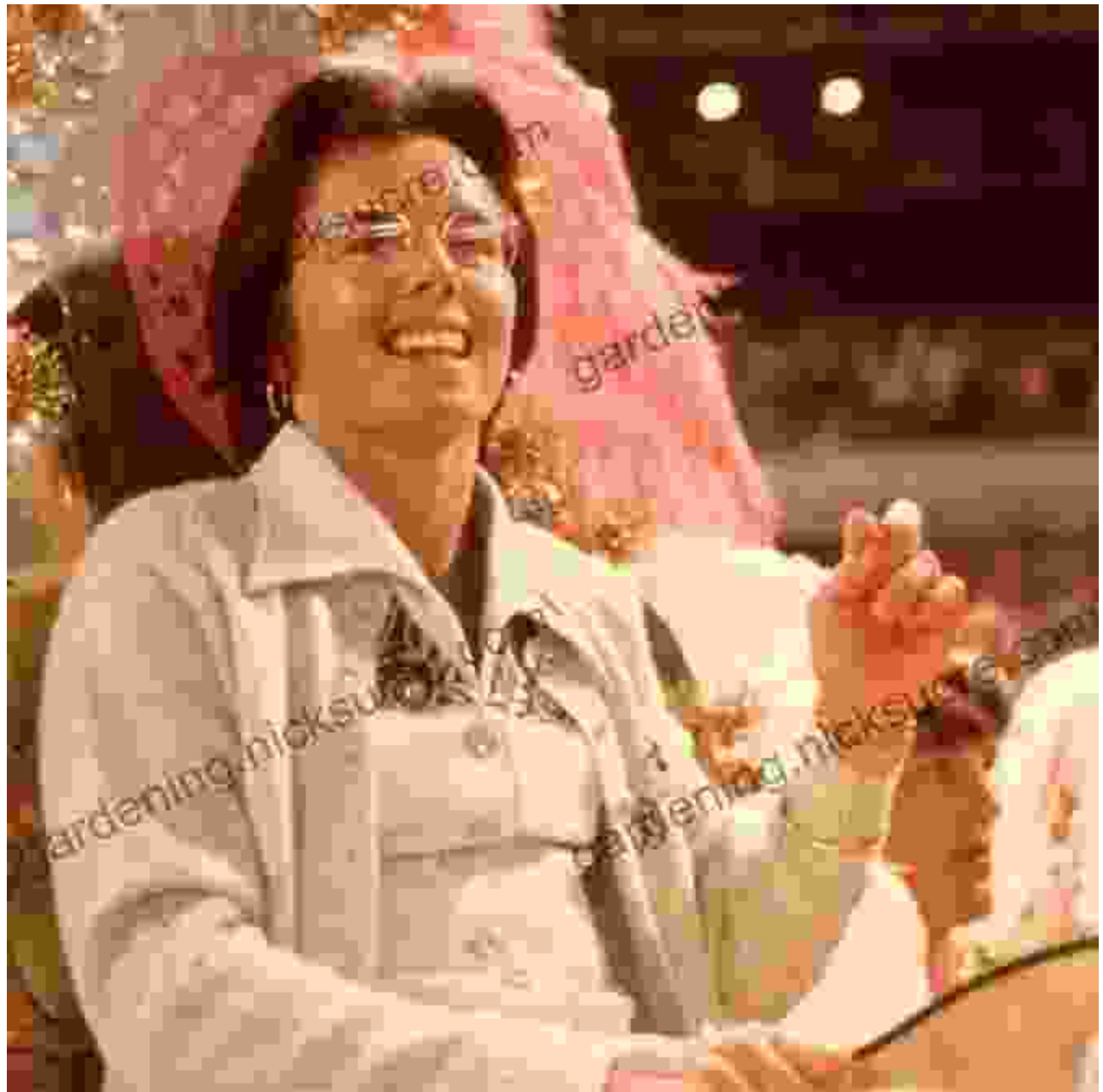
Billie Jean King and Bobby Riggs facing off in the Battle of the Sexes in 1973.

In 1973, King made history by defeating Bobby Riggs in the "Battle of the Sexes," a highly publicized tennis match that pitted the top female player against the top male player. King's victory was a major turning point in the fight for gender equality in sports.